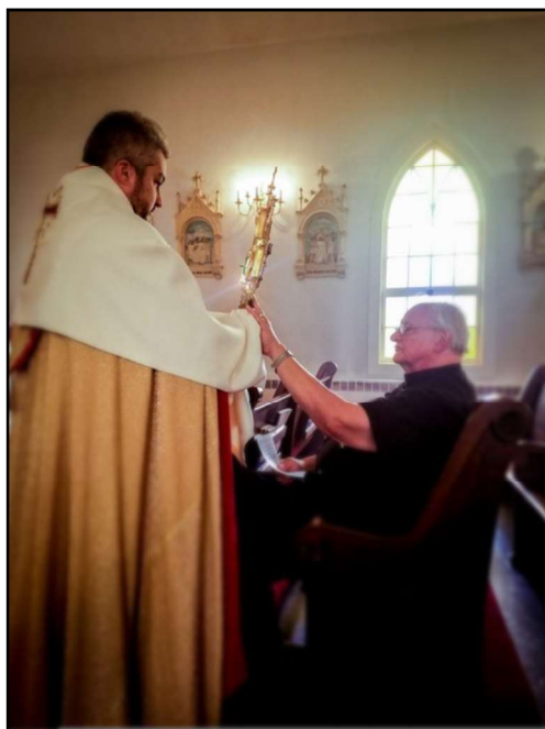
Healing prayer Service