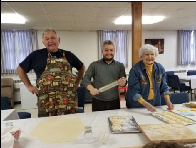
Pierogi workshop (the last one was seven years ago)