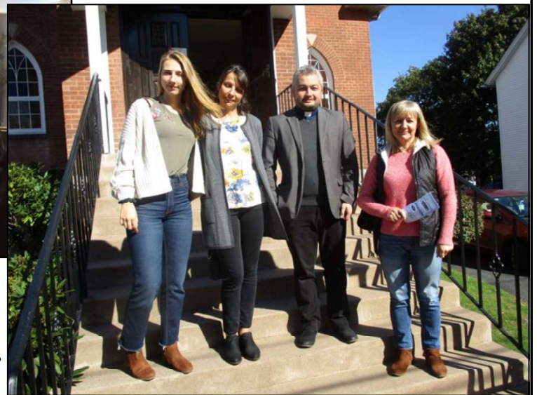
Open House at St. John's